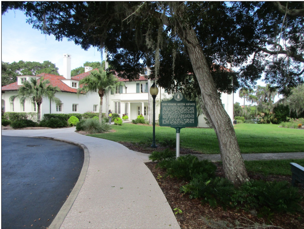
Figure 3: Edson Keith Mansion, before the heritage interpretation program, the only marked historic component of Phillippi Estate Park, Sarasota, Florida.