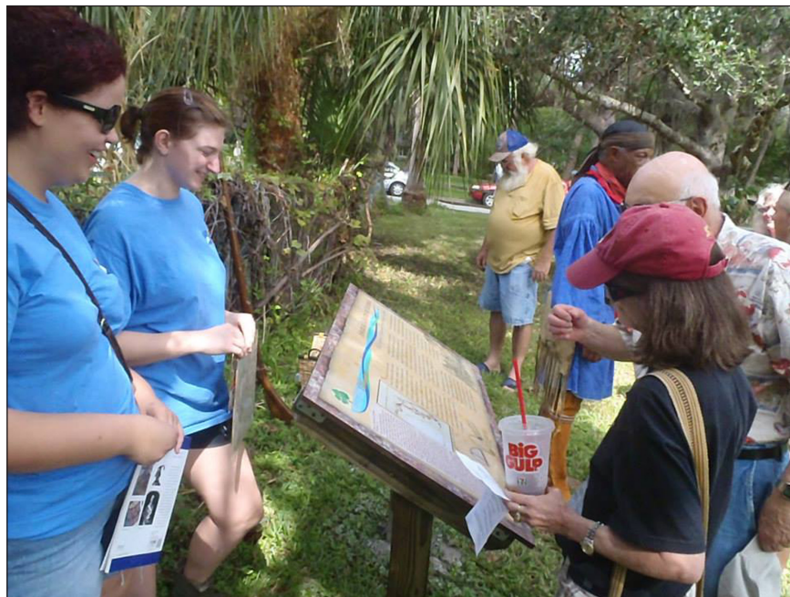
Figure 2: Signs as a Tool for a 2014 Archaeological Tour of Reflections of Manatee.

In 2016, Phillippi Estate Park installed four heritage interpretation signs: