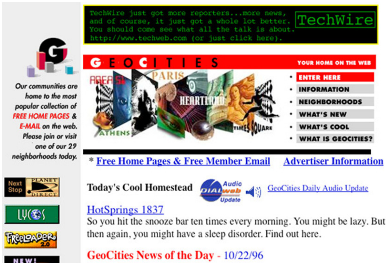
Figure 2: Geocities in 1996.

a page with actual addresses and icons separated into two columns by a winding road (Papacharissi 2002: 648). Figure 2 shows the Geocities front page in 1996, highlighting a 'featured homestead'. In practice, however, the hosted sites were often self-contained, or part of 'webring' extending outside of the Geocities domain, rather than being oriented towards an intra-Geocities community. In a primer to the concept of 'Web 2.0', posted in 2006, Madden and Fox (2006: 6) contrast the metaphor of a place used by (then waning in popularity) Geocities, with the metaphor of a person deployed by the then-ascendant MySpace. Geocities was, however, already shedding the geographical metaphors: soon after Yahoo! took control of the site in 1999, users were offered personal vanity URLs in addition to their 'street' addresses. Yet the metaphor of place and 'community' may have influenced subsequent interaction and self-presentation on Geocities. Papacharissi (2002: 655) found that Geocities members tended to display much more of a sense of community than those whose sites were hosted with Earthlink (an internet service provider that makes free web space available to members).